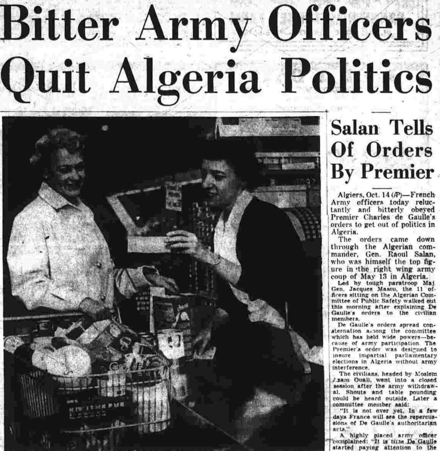
Who Has the Biggest Collection? Auction-bucks, auction bucks and still auction bucks. Hundreds of customers...